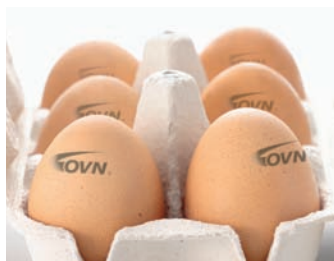
Optimum Vitamin Nutrition (OVN) ®

On October 10 DSM Food Specialties and DSM Nutritional Products celebrated World Egg Day. The main objective of this celebration was to create awareness throughout the global organization that DSM actively supports the egg industry with creative and innovative solutions, from chicken feed to processed egg products.