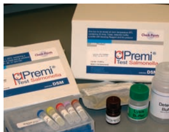
Premi ® Test