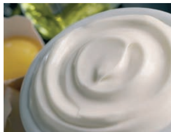
MAXAPAL ® enzymes