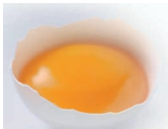
CAROPHYLL ® check